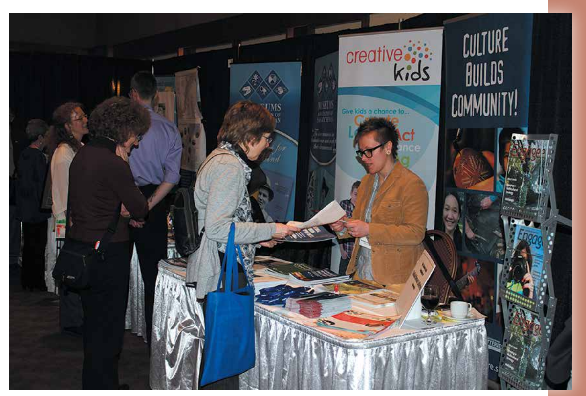
Heritage Saskatchewan Tradeshow, Forum, February 2013.