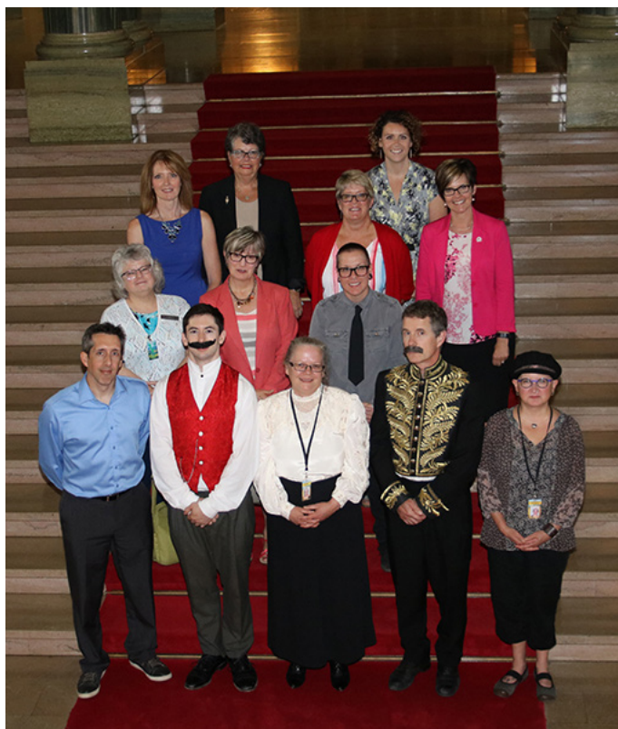
Shown here is the cast of History Alive! Vignettes , along with the partners.

Government House Historical Society Tourism Saskatchewan