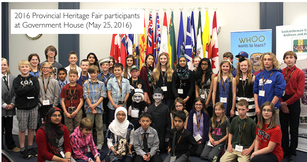
2016 Provincial Heritage Fair participants at Government House (May 25, 2016)