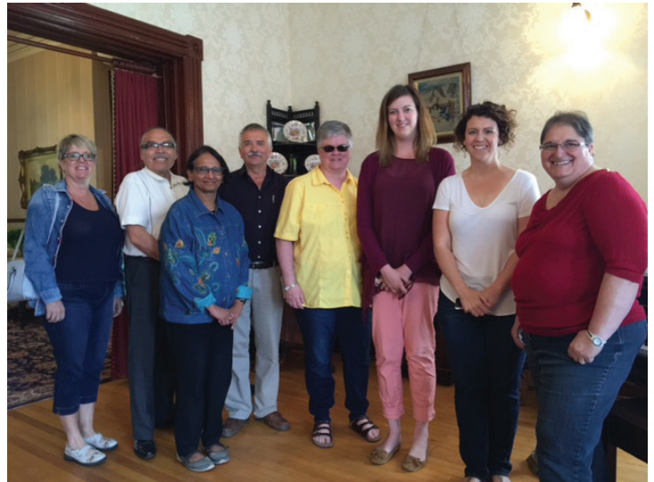
The Board at Government House June, 2016