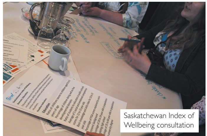
Saskatchewan Index of Wellbeing consultation